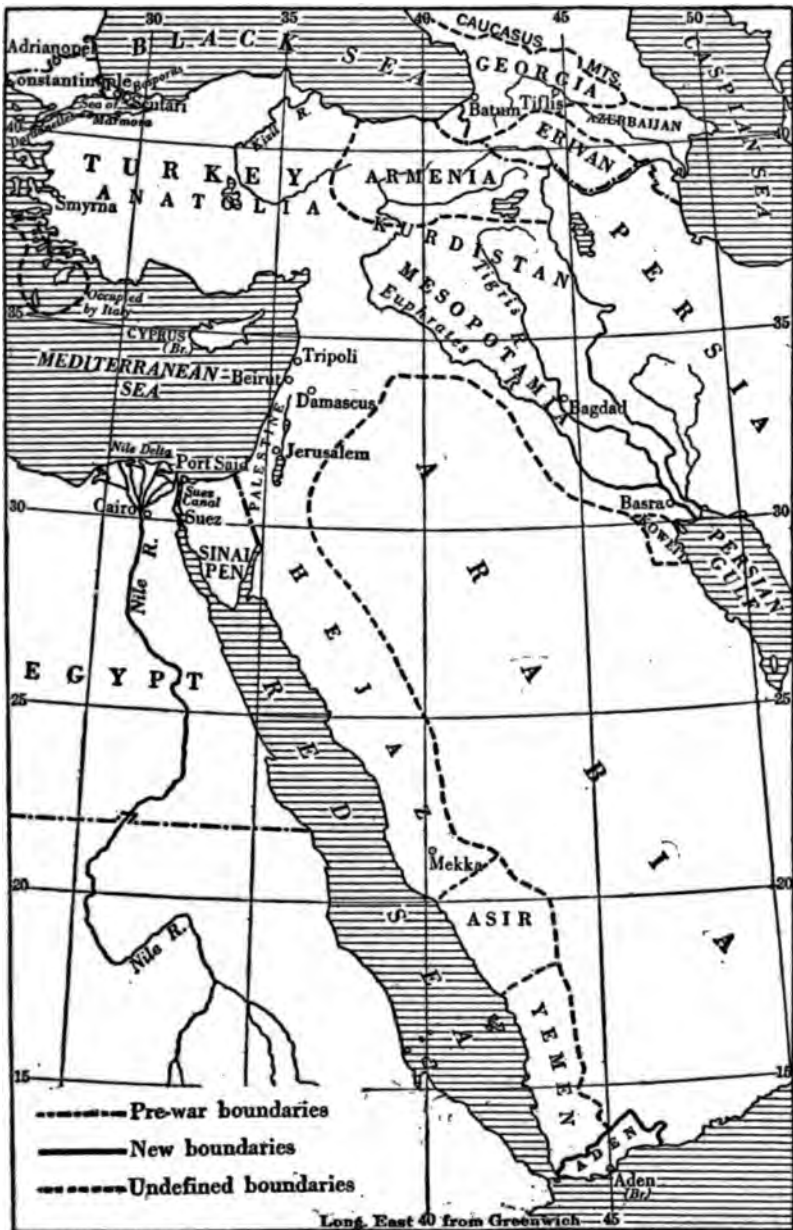
MAP SHOWING THE DISPOSITIONS MADE BY THE PEACE CONFERENCE OF THE TERRITORIES OF THE FORMER TURKISH EMPIRE